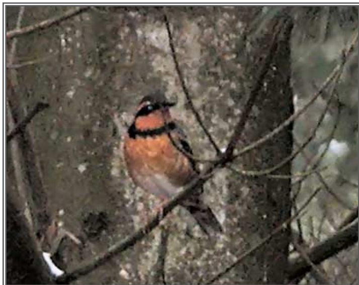
Varied Thrush – Homerville