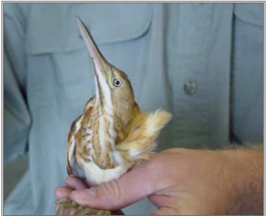
Least Bittern September 8, 2004 – Burke Airport

COMMON MERGANSER – A hen, seen lounging on the breakwall near the lighthouse at Headlands Beach SP Sep. 11, broke the previous early fall report that had stood since 1943 (Hannikman).