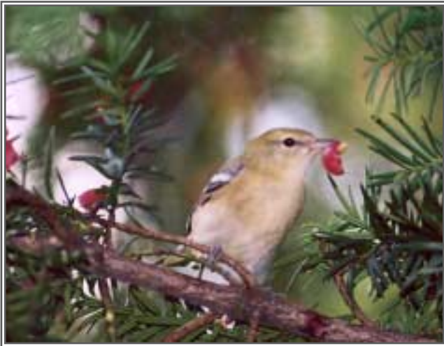
Bay-breasted Warbler – Erie St. Cemetery

13 at Mogadore Sep. 26 was an equally exceptional tally (GBE). Blackburnian Warbler totals were as good as they get at HBSP. Multiple sightings were made there from Sep. 5 through Sep. 22. The high count was 10 Sep. 7 (RH, m.obs.). One was spotted at Sandy Ridge Sep. 18 (TF). Two were at Cascade Valley MP Sep. 21 (GBE). A Pine Warbler was at Mentor Lagoons Sep. 11 (JMc). "Several" were at the Eastman Reading Garden in Downtown Cleveland Sep. 18 (SWr). Bay-breasted Warblers put in a better than average showing at HBSP. Birds were seen there daily from Sep. 4 through Sep. 28 (m.obs.). Mogadore Reservoir hosted 5 Sep. 11 (GBE). Downtown Cleveland numbers were average. A bird seen along the Ira Road Trail Oct. 18 was extremely tardy (TMR, m.obs.). Blackpoll Warblers were as expected with counts reaching 20+ in late September. One stopped by Summit Lake Oct. 7 (GBE). The only Cerulean Warblers reported were at Mentor Lagoons Sep. 14-15 (JMc). Five Black-and-white Warblers were in Richmond Heights Sep. 23 (NA). One was very tardy at Chapin Forest Nov. 1 (JP). American Redstart numbers were solid. Highs reached 30 at HBSP Sep. 19 (m.obs.). On Sep. 11, two were observed at the Eastman Reading Garden as they ganged up on a Wilson's