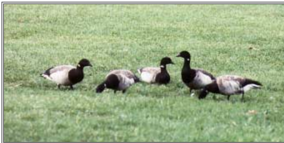
Brant October 27, 2004 – Lakewood Park

BRANT – It was a good fall for Brant in the region. The fate of the five birds at Headlands Beach SP Oct. 23 was quickly determined after they suddenly took flight and flew directly over the gunners there. (Rosche). As many as 11 Brant lounged at Lakewood Park Oct. 23–30 (Edwards, Lozano, Caldwell, m.obs.).