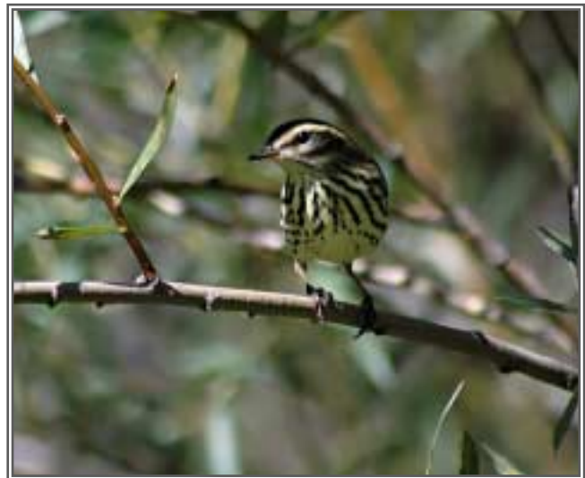
Northern Waterthrush September 18, 2004 – Dike 14