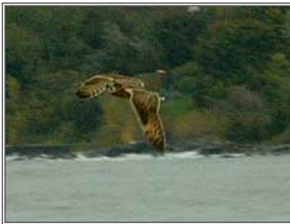
Short-eared Owl October 17, 2004– Dike 14

WHIP-POOR-WILL – On Sep 18, Spagnoli flushed a very cooperative Whip-poor-will that landed in view