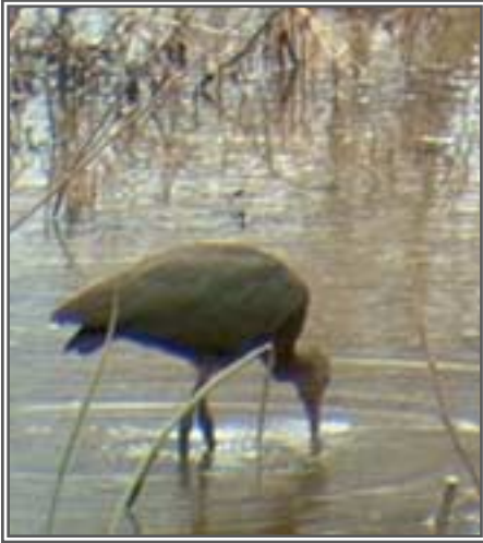
Glossy Ibis – Columbia Reservation

GLOSSY IBIS – An immature bird was studied well at Columbia Reservation and provided a Lorain County first Nov. 15 (LeGallee, m.obs.). It remained there through Nov. 24 ( fide Priebe). As always, immature dark ibises are challenging identifications, but observers were familiar with the species' differences.