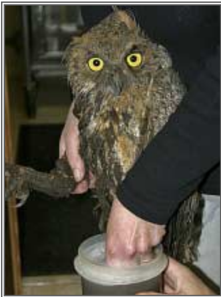
Great Horned Owl - the cleanup