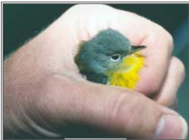
Rescued Magnolia Warbler in hand

Olive-sided Flycatchers were in excellent supply. South Chagrin hosted 1-2 birds Sep. 2-3 (BR). Another was at HBSP Sep. 2 (RH). Two were at Shaker Lakes Sep. 3 (LGo). Another was found there Sep. 9 (SBC) and again on Sep. 10 (RR). One was spied at Euclid Beach Sep. 4 (GBe). One was seen at Mentor Lagoons Sep. 11 (JMc). Two were seen there Sep. 14 (JT). Another was at Shaker Lakes Sep. 18 (JMK). Eastern Wood-Pewees left early. The last reports were Sep. 26 at Sandy Ridge (CC) and Sep. 28 at HBSP (RH, m.obs.). From Sep. 3-22, as many as 5 Yellow-bellied