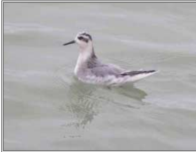
Red Phalarope October 24, 2004 – Headlands Beach State Park

B erlin Reservoir provided some outstanding shorebird reports this fall. Other sites providing reports were simply a matter of being in the right place at the right time. One can only fantasize what is happening at the landfill behind Burke Airport. Information on the waders there is difficult to extract from biologists; perhaps their reluctance to share is due to the pressure the birding community would most likely put on them to allow access to birders to this prime shorebirding site.