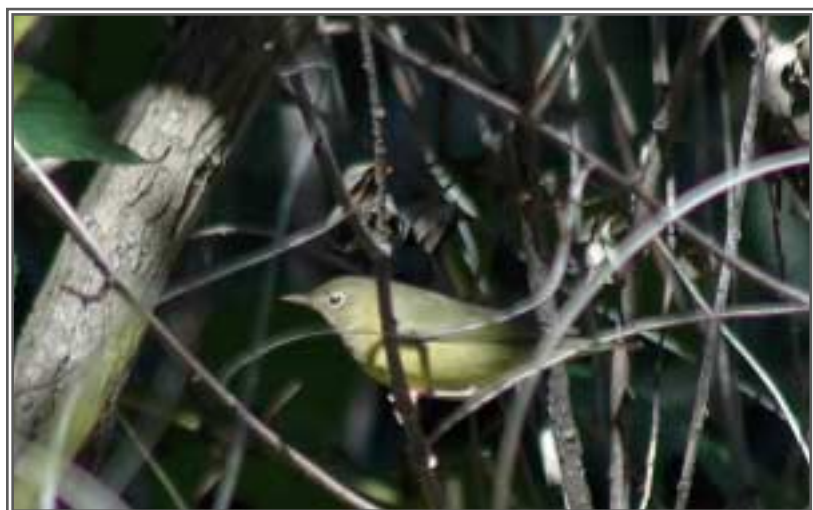
Connecticut Warbler September 18, 2004 – Dike 14

Plumage: The head was medium gray in coloration, including the crown, forehead, auriculars, sides of neck and nape. The lores were much darker than the rest of the head. The eyes were jet black. Under certain light conditions and different angles, a fairly distinct, dark eyeline was present. The back and scapulars were a few shades lighter than the head. The throat, chin and upper breast were pale gray, being lighter than the back. The lower breast, belly, flanks, sides and undertail coverts were washed with a pale rufous coloration. In flight, the primaries were pale gray in coloration, as seen from above (See included photograph). The greater and median coverts were darkish gray with distinct whitish wingbars tinged with rufous. The tips of the blackish rectrices showed relatively noticeable, whitish edges. These last two field characteristics, pale rufous wingbars and whitish tipped tail, indicate that this flycatcher is a first-year bird. The tertials had whitish