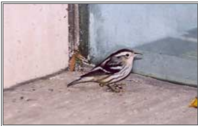
Black-and-white Warbler – Erie St. Cemetery

R eports of warbler migration ranged from so-so to outstanding. The outstanding came from observers who were able to venture into the field daily. Apparently, the more coverage the better the results. Sound familiar? Numbers are difficult to assess