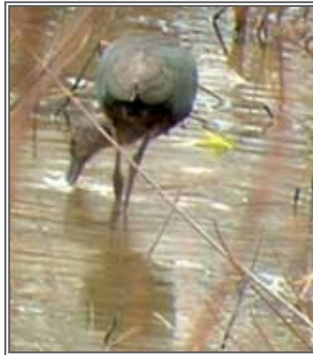
Glossy Ibis – Columbia Reservation

PEREGRINE FALCON – This editor does not mean to slight the presence of the local birds, but it is often difficult to sort out the migrant from the residents in the reports. Our nesters fared well last summer and some of the following reports may reflect migrants or birds that were out stretching their wings, so to speak. A bird was at Sandy Ridge Sep. 25 (Grame fide Fairweather). One was seen near the Cleveland