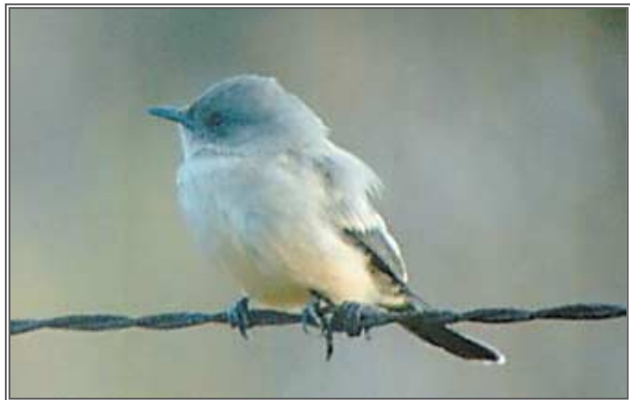
Say's Phoebe October 24, 2004 - Dike 14

A Snow Goose was record early at The Ira Road beaver pond in the CVNP Sep 19 (RRo). Tundra Swans left lasting impressions on the region this fall. The early flocks started showing up in mid-November. A group of 32 was at LaDue Nov. 13 (DJH). Another vanguard group of 146 was detected at Oberlin Reservoir Nov. 13 (CRi). Flocks totalling 70 birds flew west to east past Edgewater CLSP Nov. 15 (PL). On Nov. 21, 34 were watched as they formed a "perfect V" over Thompson (BB). Another 50 passed over Lakewood the same day (JM). These groups were precursors of the stellar movement to come the following days. A large wave of swans came Nov. 22-23 when hundreds upon hundreds of birds were reported. Groups totalling 250 birds passed by HBSP that Day. Lake Rockwell hosted birds coming and going all day with a maximum count of 800 there in the afternoon. The Lake