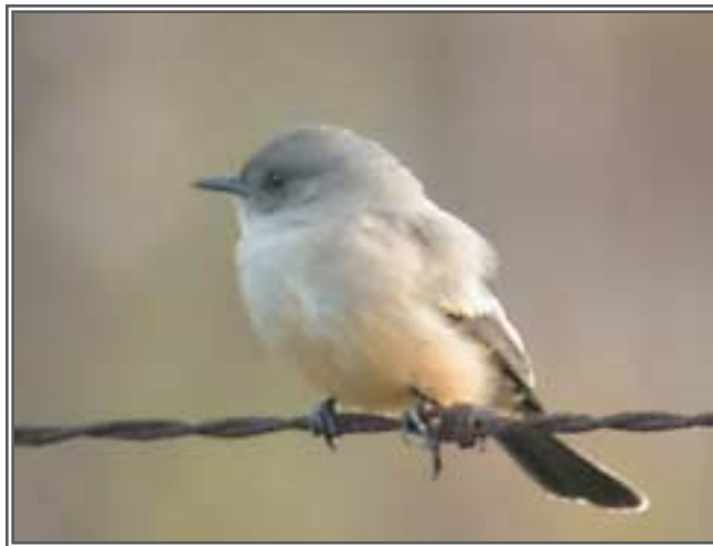
Say's Phoebe October 24, 2004 – Dike 14

SABINE'S GULL – An immature was off Lakeshore Reservation Nov. 26 (Pogacnik).