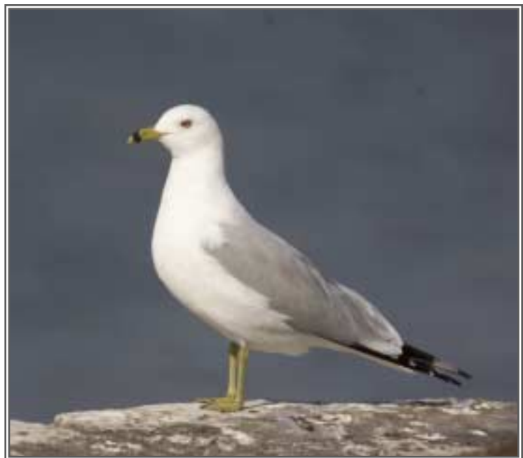
Ring-billed Gull

Five Red-headed Woodpeckers were seen at Sandy Ridge Sep. 26 (TMR). Yellow-bellied Sapsuckers were widespread. At HBSP, 3-7 were seen daily from Sep. 26 through Oct. 2 (RH). Elsewhere there were small numbers and many lingerers that