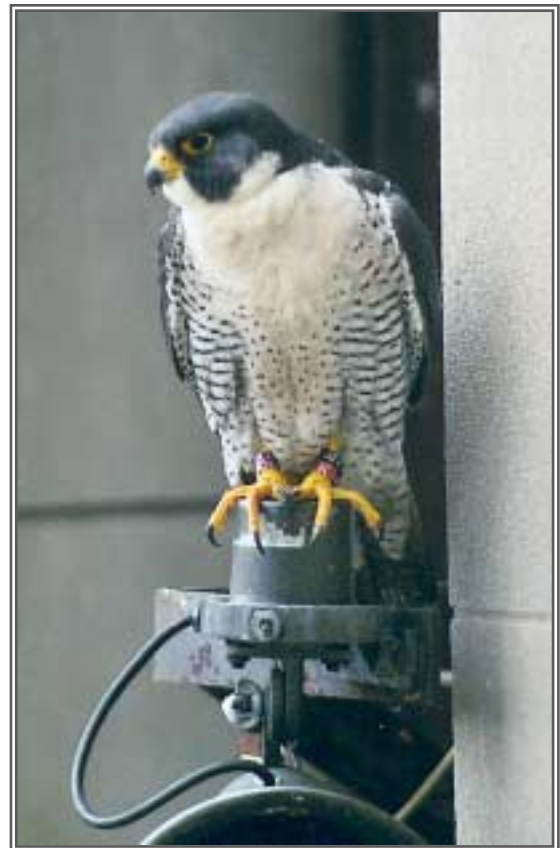
Peregrine Falcon