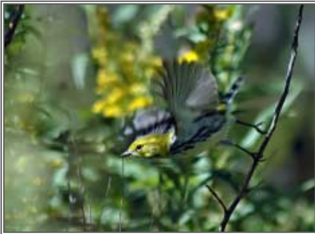
Black-throated Green Warbler September 19, 2004 - Whiskey Island

indicated they may be overwintering in higher numbers than is usually thought. Along Lake Erie, Northern Flicker migration was fair, but no tallies reached the century mark.