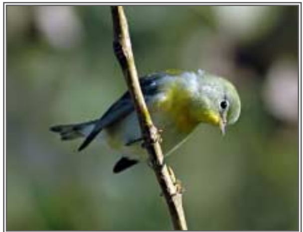
Northern Parula September 18, 2004 - Dike 14

Observers in all regional counties were pleased with the abundance of Red-breasted Nuthatches this fall. These irruptive invaders show a definite preference for feeding stations with ample supplies of nearby conifers. Brown Creepers were in solid numbers. The last House Wren