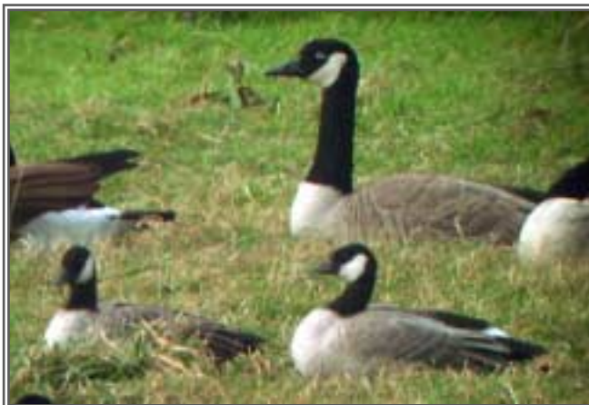
Cackling Goose--Canada Goose size comparison