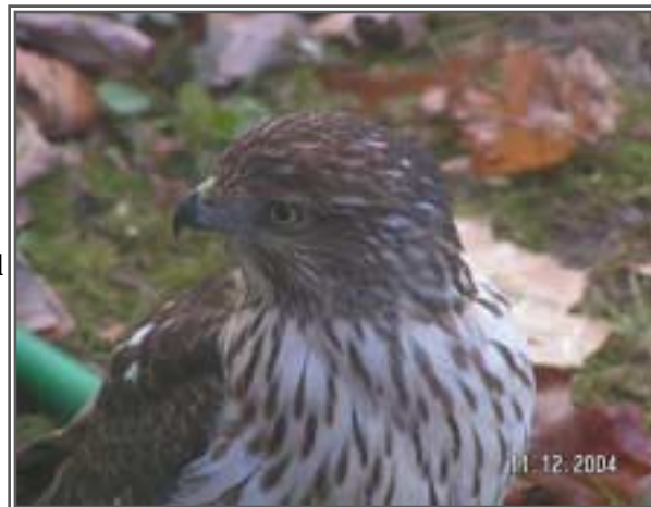
Immature Cooper's Hawk - Streetsboro

were noted along the lake. The high inland count was 25 at LaDue Nov. 21 (VW). The 28 Pied-billed Grebes at Nimisila Reservoir Nov. 14 was the high (GBe). The high count of Horned Grebes was 78 along the West Side Nov. 17 (PL). The inland highs were a mere 8 at Portage Lakes Nov. 14 (GBe) and Ladue Nov. 23 (BFi). Double-crested Cormorant numbers continue to get out of control. The 140 at little North Reservoir in Summit County Oct. 17 was testament to their local abundance (GBe). Great Egrets were found in their usual numbers at wetlands away from Lake Erie. A bird lingered at LaDue well beyond the usual October departure (BFi, BMc, m.obs). The last sighting there was Nov. 21 (LR). Late Green Herons were seen in Akron Oct. 10 (GBe), Lake Rockwell Oct. 22 (LR) and Sandy Ridge Oct. 30 (TF). Black-crowned Night-Herons lingered at Shaker Lakes though Oct. 22