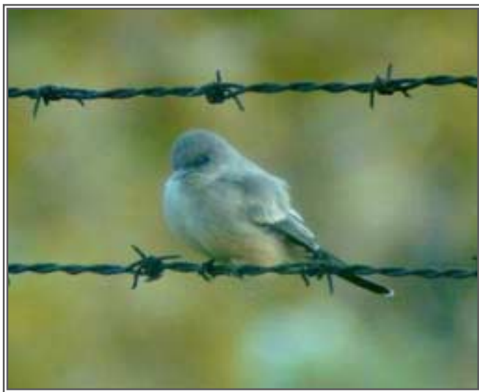
Say's Phoebe October 24, 2004 - Dike 14

Elimination of similar species: An adult female vermilion flycatcher has a short tail with white edges along its length, a whitish supercilium, relatively distinct ear patch, short bill and streaking on its breast. The observed flycatcher had a long tail with whitish tips, no distinct facial markings (except eyeline, at times), longer bill and no streaking on its breast. All Myiarchus flycatchers have rufous coloration in their primaries, and the observed bird did not have this characteristic. Both gray kingbird and eastern kingbird have white breasts and undertail coverts, unlike the observed flycatcher. Both fork-tailed and scissor-tailed flycatchers have very long, exaggerated forked tails. All other Tyrannus flycatchers have pale yellow coloration in their underwing coverts, while photographs of the observed flycatcher show pure white. The closest possibility to